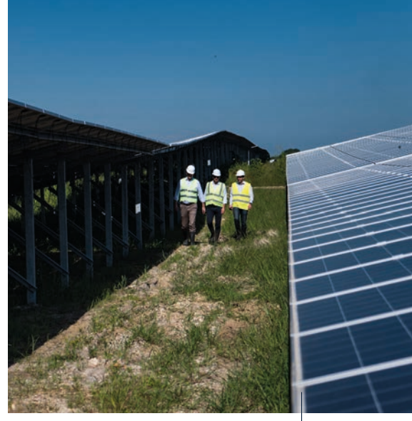
DURING CONSTRUCTION OF THE SOLAR PARK PARADISE PARK, JAMAIKA